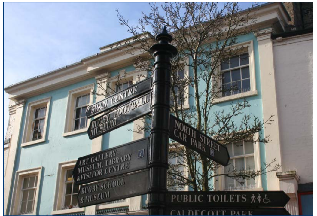
We need to be brave with our town centre but also realistic. Town centres are changing.

Your Conservative leadership and councillors want Rugby to have a great town centre and we want to move forward positively.