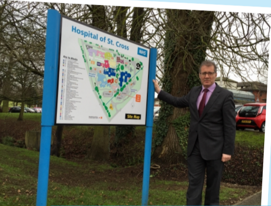
Mark Pawsey MP at St Cross

Since then Mark has secured a debate in Parliament on this pressing issue and has called upon the government and the NHS to work together to bring Accident & Emergency care to Rugby.