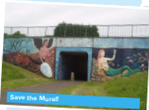
Save the Mural!