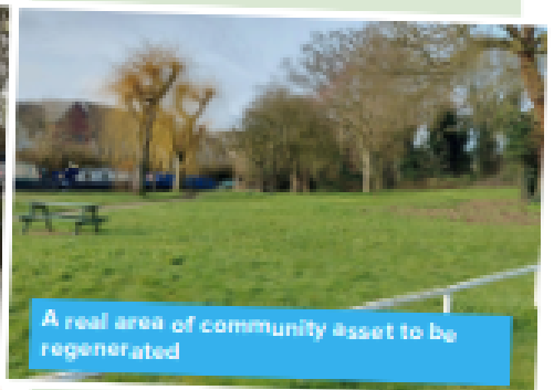
A real area of community asset to be regenerated

Your local Conservative team are fully supportive of regenerating this area – Left neglected for years, we think this area could be a real asset for the local community.