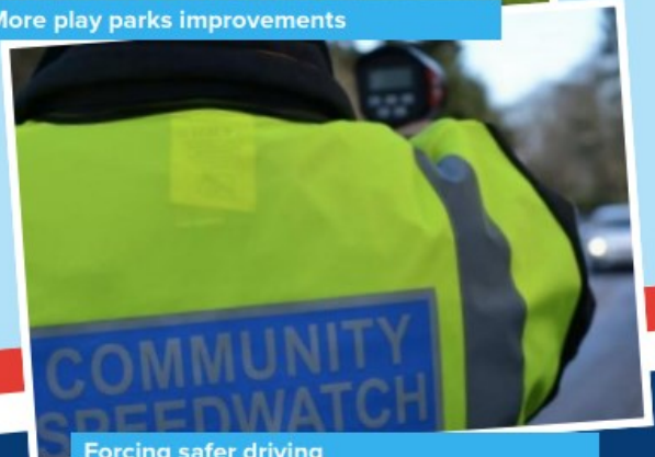
Forcing safer driving

Contact your Conservative team for Newbold-on-Avon & Brownsover