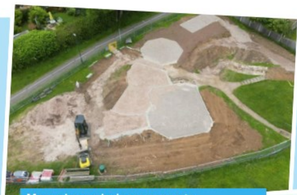
More play parks improvements