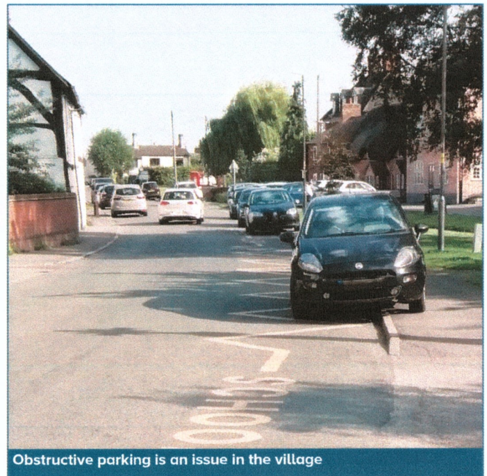
Obstructive parking is an issue in the village

On Main Street, during peak school run times, motorists are encouraged to consider using short term parking spots that are available at the Village Hall. Similarly, the landlord of the pub has kindly offered a few parking spots during these peak times.