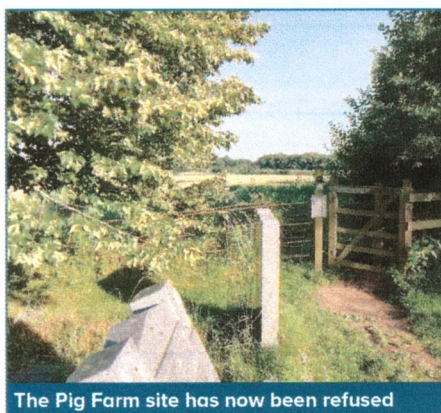
The Pig Farm site has now been refused

We would like to thank everyone who contributed towards the building of a strong case against this application, leading to the