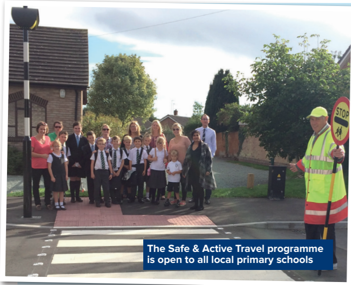
The Safe & Active Travel programme is open to all local primary schools