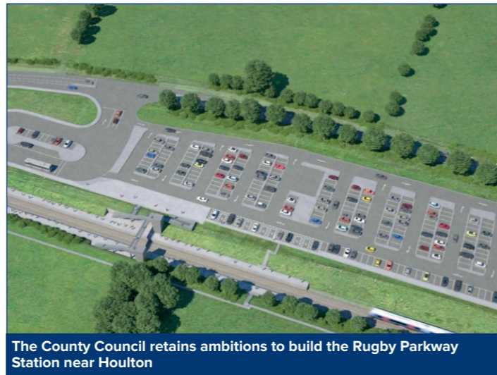
The County Council retains ambitions to build the Rugby Parkway Station near Houlton