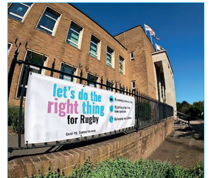
Our local councils have been doing the right thing for Rugby

We still have a long way to go in the fight against the virus but the strong relationship and ongoing co-operation between both of our local councils has been key in supporting residents and businesses in Rugby.