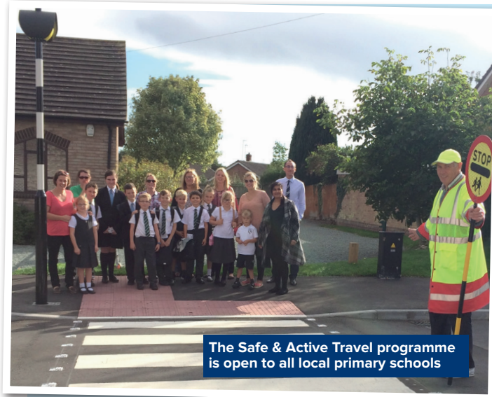
The Safe & Active Travel programme is open to all local primary schools