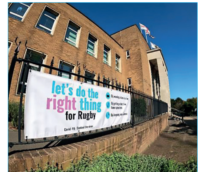
Our local councils have been doing the right thing for Rugby

We still have a long way to go in the fight against the virus but the strong relationship and ongoing co-operation between both of our local councils has been key in supporting residents and businesses in Rugby.