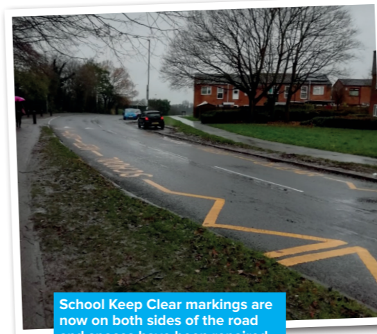
School Keep Clear markings are now on both sides of the road and spaces have been repaired

In January, Warwickshire County Councillor Jill Simpson-Vince met with County Highways Officers and Warwickshire Police to look at improvements to the entrance and area around Boughton Leigh schools, looking at how the junction was used and where people parked their cars.