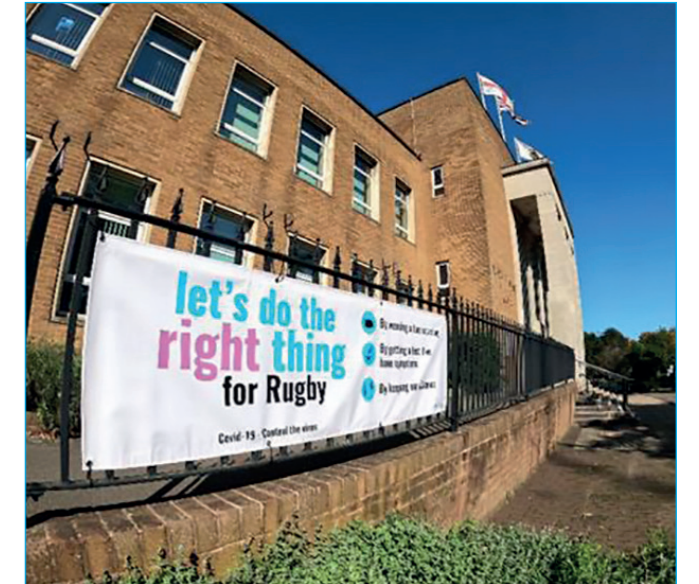
Our local councils have been doing the right thing for Rugby

We still have a long way to go in the fight against the virus but the strong relationship and ongoing co-operation between both of our local councils has been key in supporting residents and businesses in Rugby.