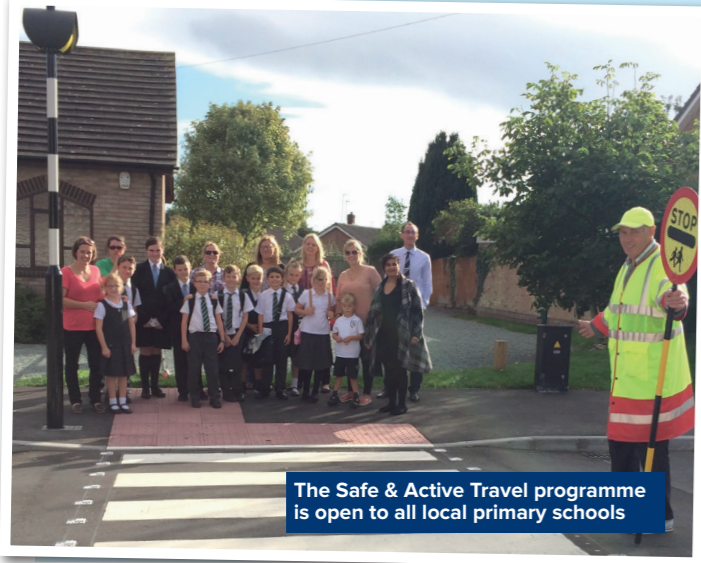
The Safe & Active Travel programme is open to all local primary schools